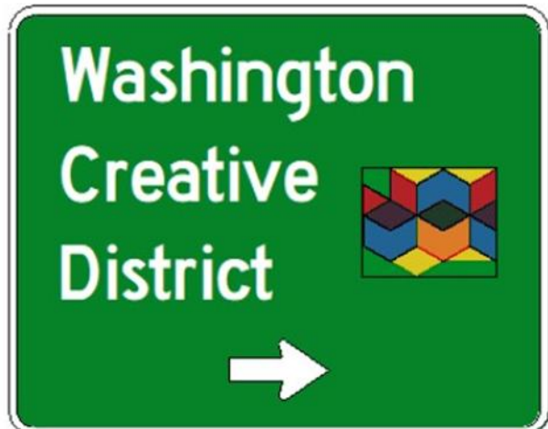
Sign 4 -SR 17 MP 75.79 NB

5' x 4' sign to be installed on existing luminaire